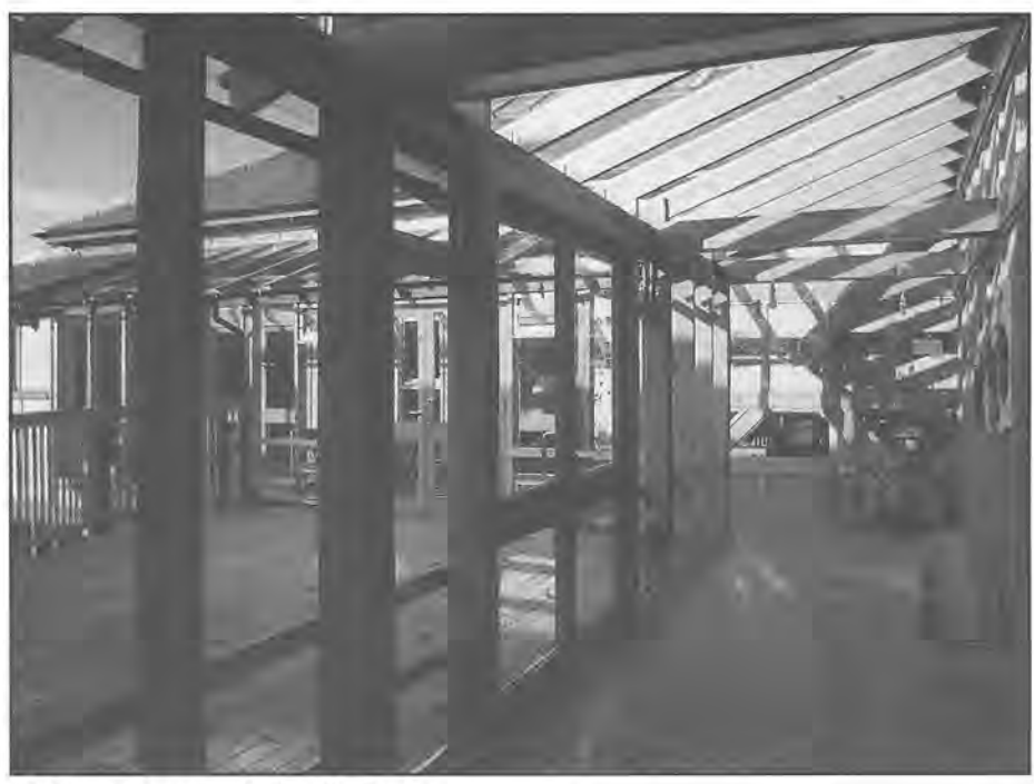
Maldwyn Nursery & Family Centre

Further to our report in YOU BUILD NO. 8, the Family Centre Building has been occupied and in use since September '92. The new building has generated much interest and many enquiries, thus attracting some new users, the Counselling Rooms are used regularly and the new facilities have already been the venue for